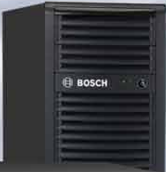
DLA 1200 Series IP Video Storage Appliance for zero-fuss recording and storage