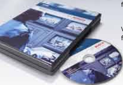
Video Recording Manager (VRM) software for maximum control and scalability