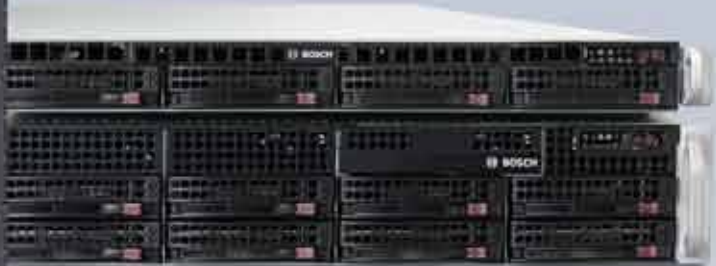
DLA 1400 Series IP Video Storage Appliance for zero-fuss recording and storage