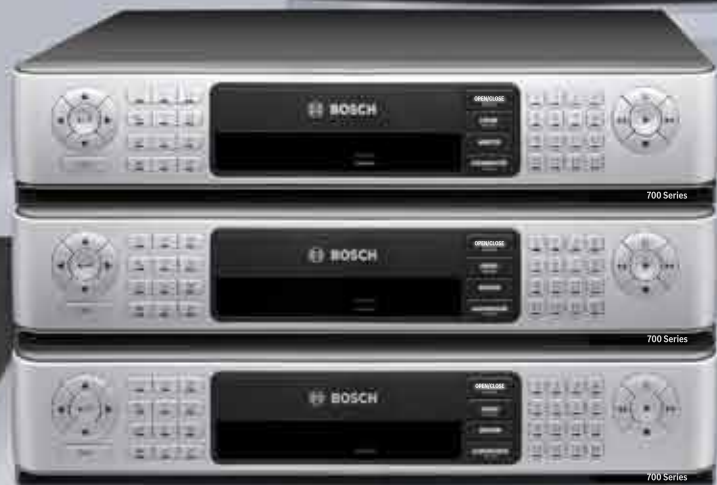
Divar Hybrid and Network Recorder 700 2) Series for demanding system applications