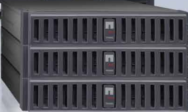
DSA Series iSCSI Video Storage Arrays for highest data availability