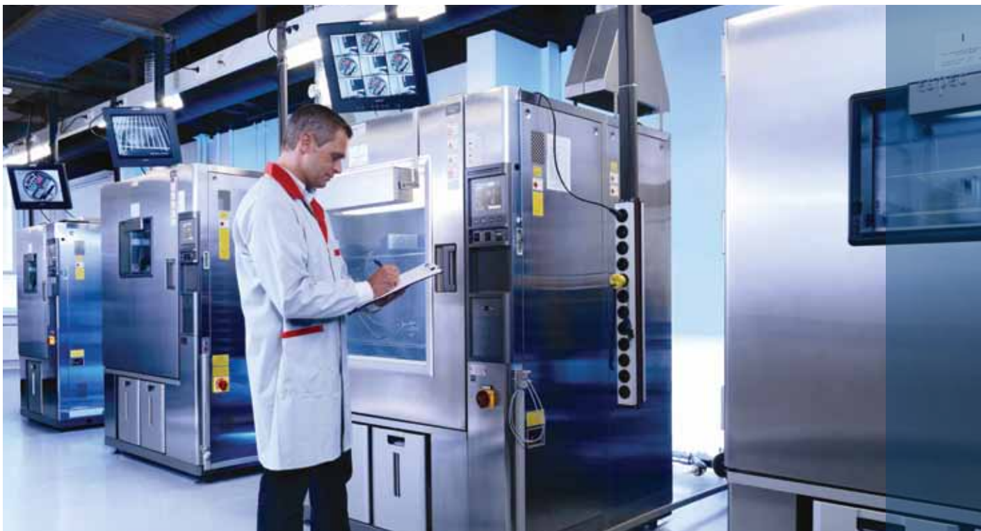
Bosch Security Systems test and research facilities in Eindhoven, The Netherlands

Our dedication to quality and high system availability is also reflected in the way our products interact with each other. Our high-end